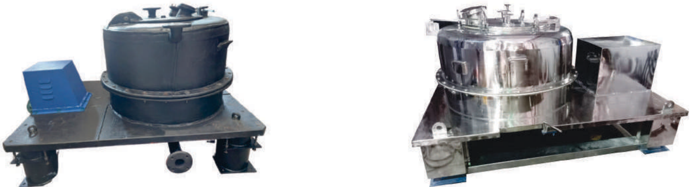
TABLE TOP / PILOT PLANT / CENTRIFUGE MACHINE